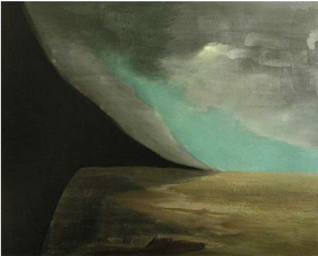
Helen Lundeberg 1908-1999 The Edge Oil on cardboard c.1951 16 x 20 inches (40.6 x 50.8cm)